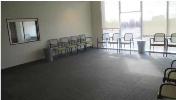
Clinic Waiting Area