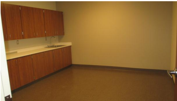
One of the many Break Rooms