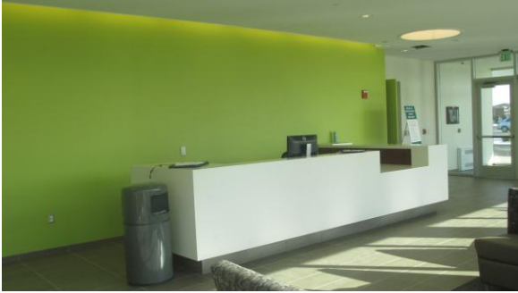
First Floor Lobby

T olan Park – The long awaited debut is here!!! As we all anxiously wait for our move dates next week, here’s a sneak peak!!