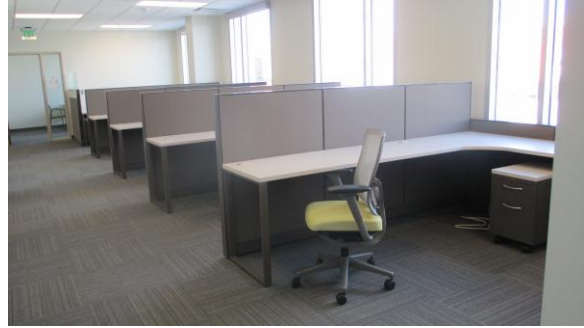
Suite 5A – Education and Training