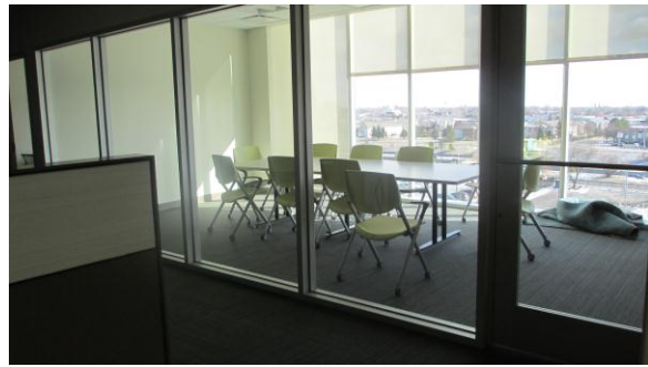
One of the many conference rooms throughout Tolan Park.